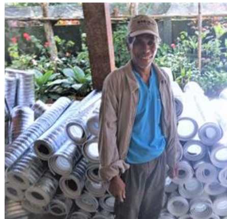
Rare image in these dark days: a big smile!