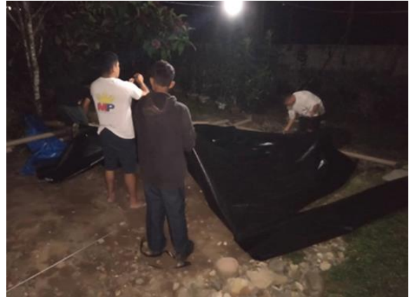
Loving brethren up late cutting "trapals"