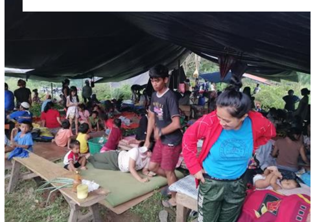
Note child on cot under tarp. This is “home” for an indefinite period of time.