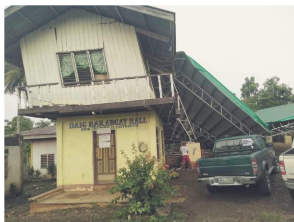
One of many government buildings damaged.