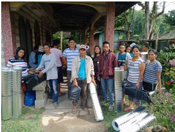
Grateful brothers & sisters receiving supplies