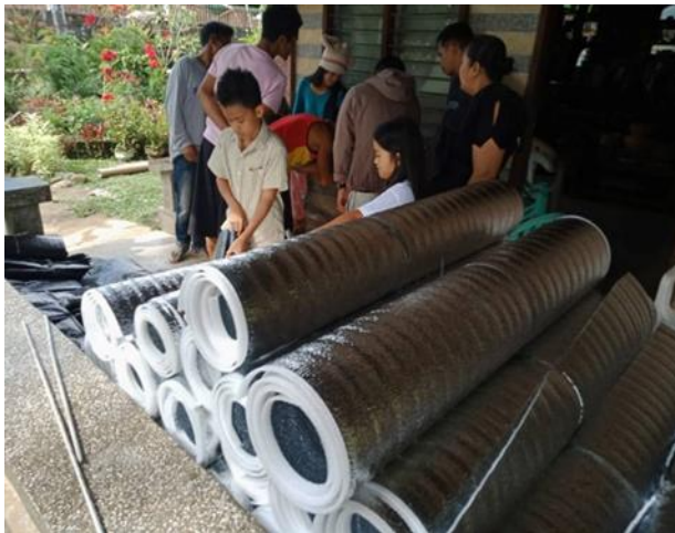
Their kids helping with PE insulation used for cots